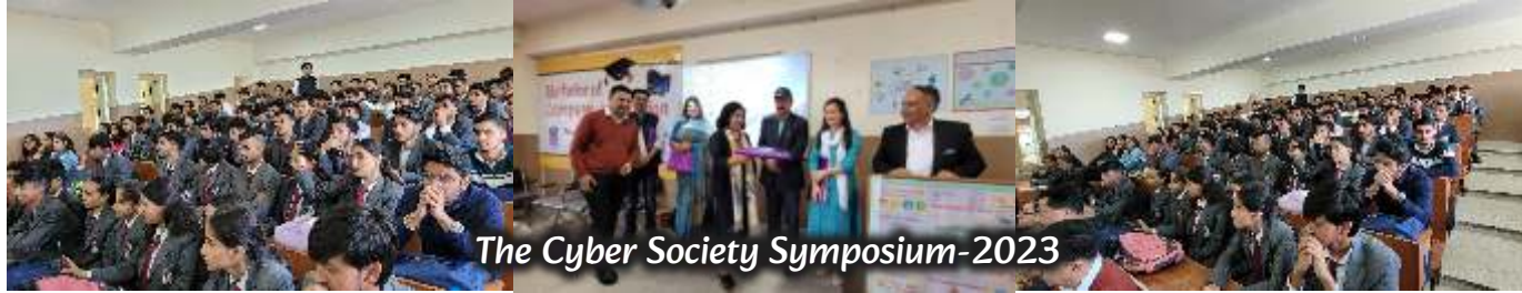
The Cyber Society Symposium-2023